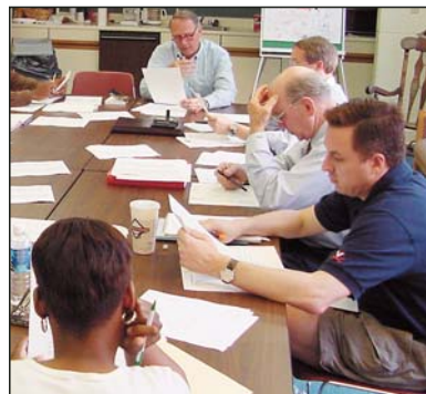
FUNDRAISING — grant writing, event promotions