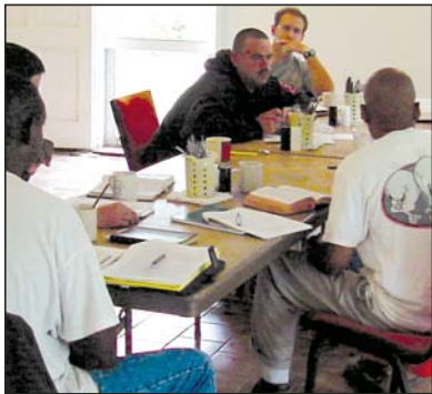
TEACHING LIFE SKILLS CLASSES AND BIBLE STUDIES

If you have the heart to see men's lives transformed and want to do more, please call the Volunteer Coordinator at 434/293-0499, or reach us by e-mail at bridgeministry@earthlink.net .