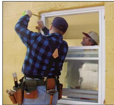
FACILITIES SUPPORT — group projects, maintenance and repair