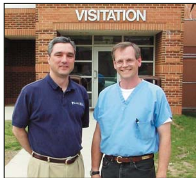
IN-JAIL BIBLE STUDIES